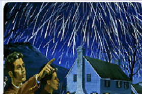
240,000 stars lit up the sky all at once in 1833!

*Note: This prophecy was fulfilled on November 13, 1833. Eyewitnesses reported 240,000 meteors all at once! The celebrated astronomer and meteorologist, Professor Olmstead, of Yale College, says: "Those who were so fortunate as to witness the exhibition of shooting stars on the morning of November 13, 1833, probably saw the greatest display of celestial fire works that has ever been since the creation of the world, or at least within the annals covered by the pages of history." -Our Lord's Great Prophecy, page 35.