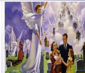
A resurrection will take place at Jesus' coming.

C) The righteous dead will rise first, then the righteous living will ascend to heaven.